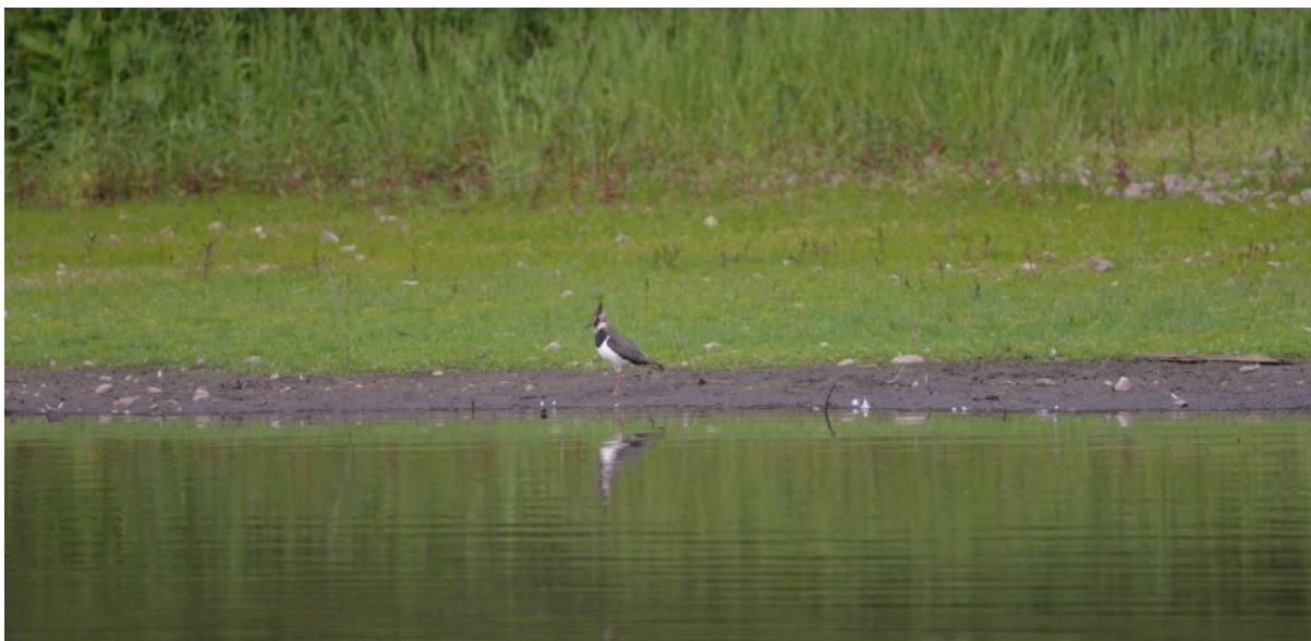
Figure 2. Lapwing at the more southerly of the two ponds on the site (O'Hara, 2020)

A local resident confirmed that 'it's a real wildlife haven particularly around May - lots of swallows darting over it' (O'Hara 2021 pers.comm.)