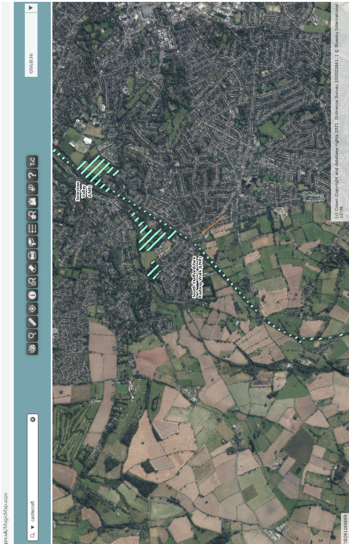
Appendix 2 - NBN Atlas bird

Appendix 1. The wildlife corridor along Local Nature Reserves from urban Wolverhampton towards Wombourne ( https://magic.defra.gov.uk ). Arrow indicates position of site