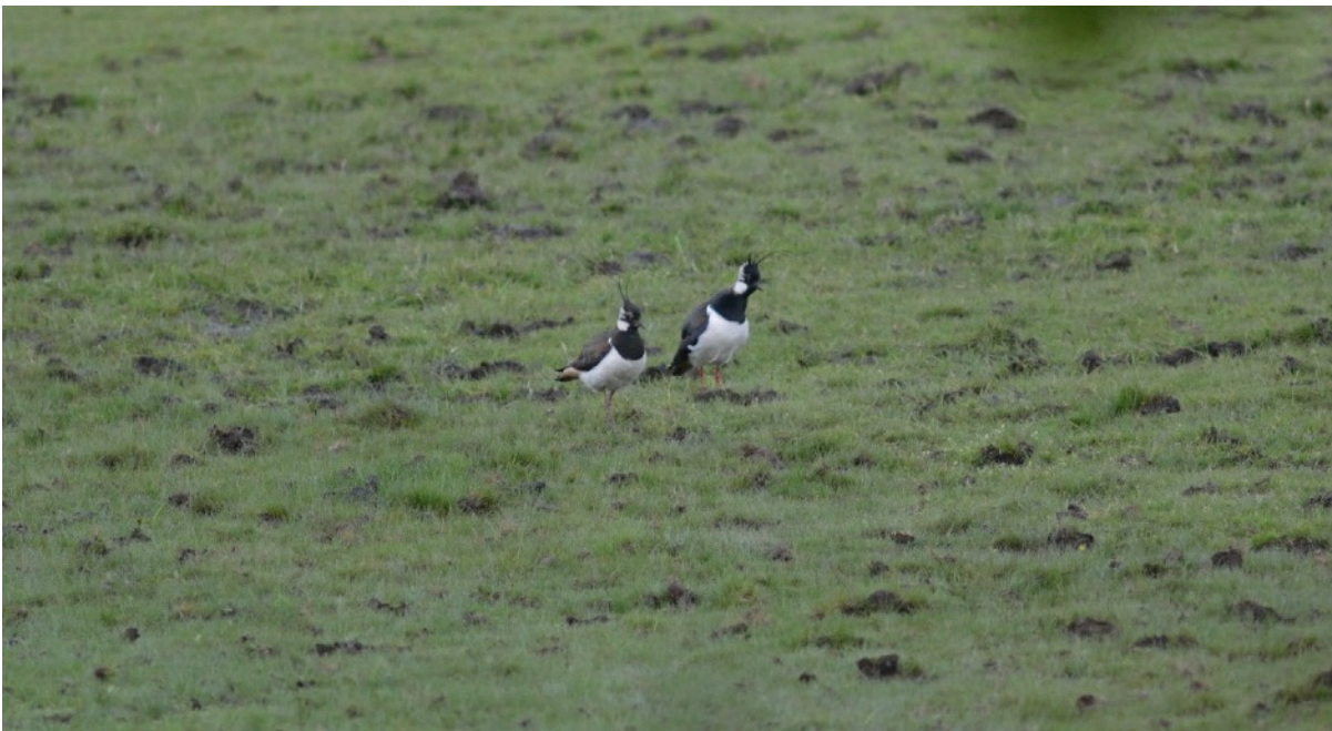
Figure 1. Lapwing on the site (O'Hara 2021)

Lapwing have been recorded in 2020 and 2021 on the site (Staffordshire Ecological Record) (Figure 1). Lapwing Vanellus vanellus is listed as Near Threatened on the IUCN Red List of birds and is decreasing at a moderately rapid rate. It is on the UK bird red list and is protected under the Wildlife and Countryside Act 1981.